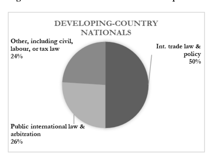
Figure 1: FTA arbitrators' main areas of expertise

arbitrators nominated to FTA rosters by some Latin American or Eastern European countries (among whom only from fifteen percent to twenty-nine percent of individuals fit this description). Note that within the group of the EU FTAs with Eastern European developing countries (the 'EE' group), we presented statistics both with and without the EU-Georgia FTA, which is a peculiar case. Perhaps appreciating the lack of sufficient experience among its own nationals in the field of international trade law, Georgia decided to nominate non-Georgian renowned experts in this field, such as Christian Häberli, Donald McRae, John Adank, Ronald Saborío, and Thomas Cottier, to the EU-Georgia FTA roster of arbitrators.